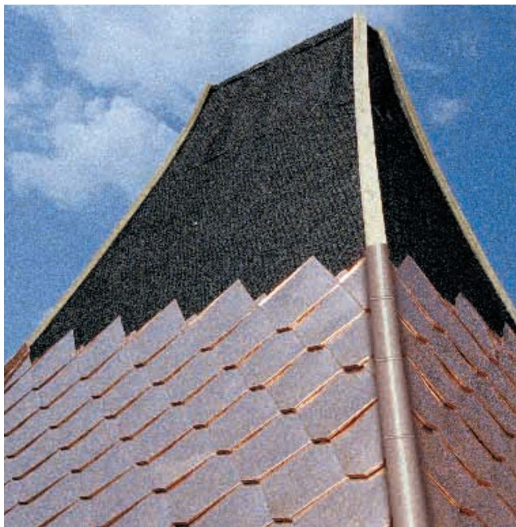
DELTA®-TRELA is the optimum air-gap sheet for high-quality metal roofs.

DELTA®-TRELA PLUS with the integrated self-adhesive edge provides even more energy savings and faster wind-tight installation.