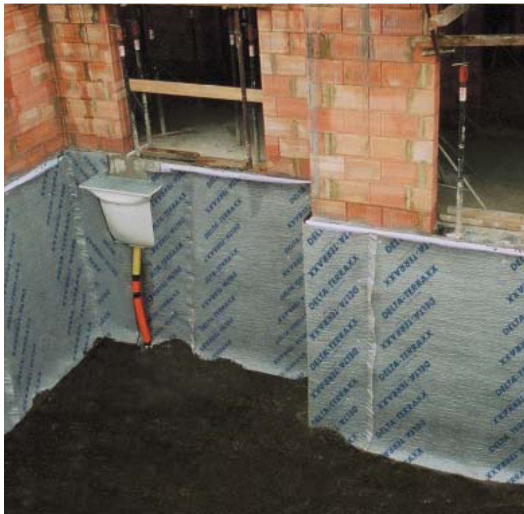
DELTA®-TERRAXX offers permanent-filtration draining.