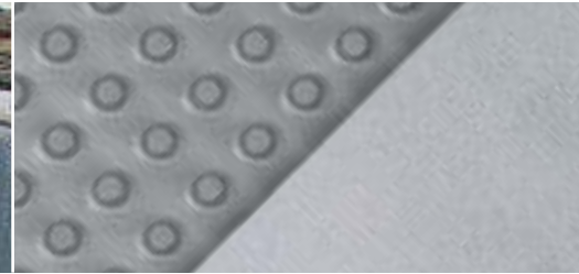
NOPPENBAHNEN-PROFIL with DELTA®-GEO-DRAIN CLIP.