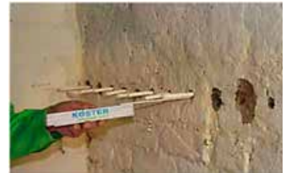
1) Setting out and insertion of Koster Capillary Rods. Protruding from the borehole by 7cm.