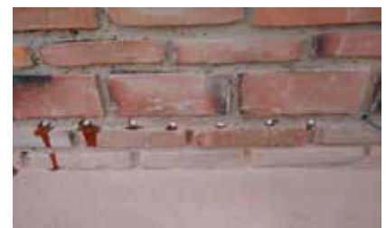
4) Material can be seen inside the boreholes post injection. Fill boreholes with Koster KB Fix 5