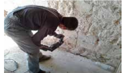
1) Setting out and drilling of 14mm boreholes

Once all injection works have been completed, re-plastering should be done using a hydrophobic and salt encapsulating plaster such as the Koster Restoration Plasters.