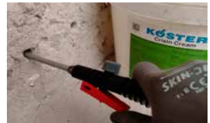
3) Alternative Method: Using a hand pumped sprayer to inject the Koster Crisin Cream