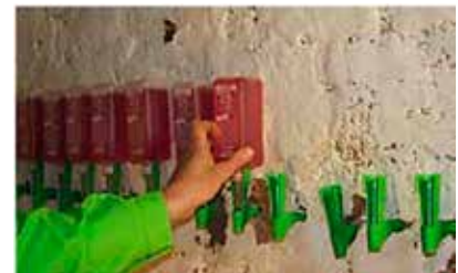
3) Attach the nozzles to the Koster Crisin cartridges and fix into the Koster Suction Angles. Leave in place until they are empty.