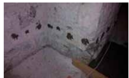
4) Remove cartridges and suction angles, trim capillary rods flush with wall and push about 1cm further back into borehole before filling with Koster KB- Fix 5