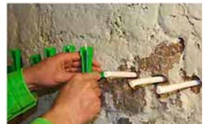
2) Insert the ends of the Koster Capillary rods into the Koster Suction Angles and push into the boreholes.