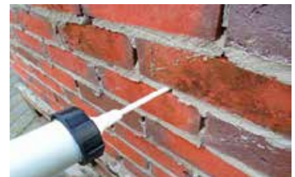
2) Injection using a caulk gun, long injection nozzle and the 600ml foil packs